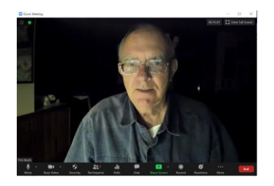
Live Chat is optional.